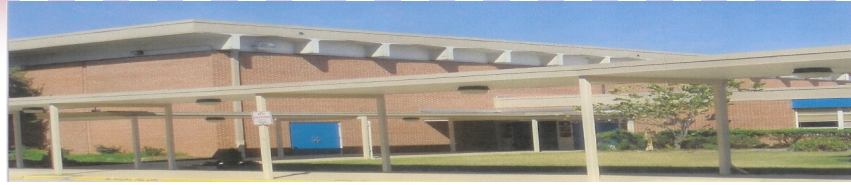
Oak Hill Elementary School